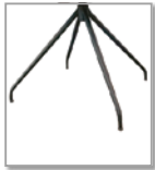
quadpod leg fixed black