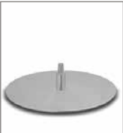
turntable matte chrome look for MD