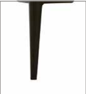
metal leg, diff. metal col.