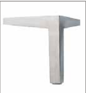
metal leg, gloss