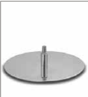
turntable high-gloss chrome for MD