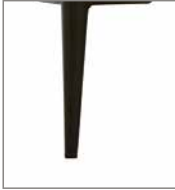
metal leg, diff. metal col.