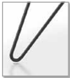
hair pin frame black