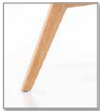
wooden frame naturally oak P 58