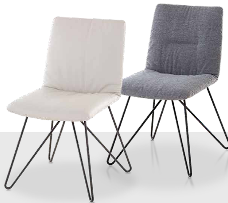
Covers: leather Z73/43 cream white and fabrics W82/22 grey