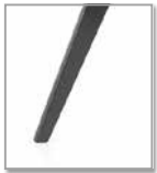
wooden fram black oak P 99