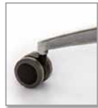
base with castors soft diff. colours