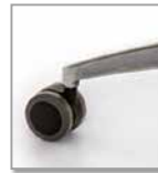
base with castors hard diff. colours