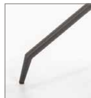
metal cross black, swivel/autoreturn mech. (surcharge) F Y6

wooden frame F M8, in different wood colours - naturally oak oiled P 58; oak white wash P 60; oak black P 99