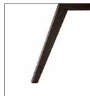
wooden leg black oak P99 F M8