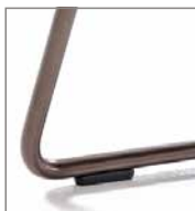
tube-wire frame different metal colours F M5