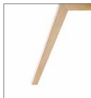
wooden leg oak white wash P60 F M8