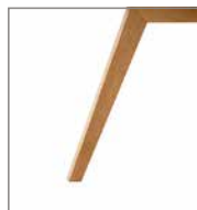
wooden leg oiled oak P58 F M8