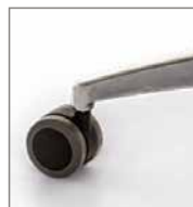
base with castors hard diff. colours F 56